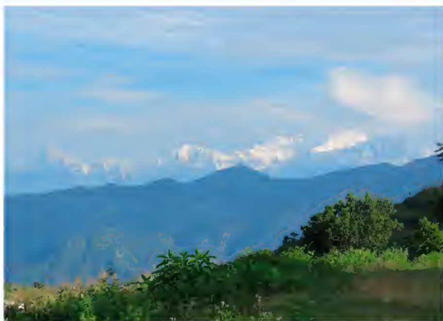
Fig. 3. Habitat of Liopeltis rappi at Dhodeni, Kabilas, Chitwan.

into towns. The present record of the dead specimen from cultivated land tends to show the possible ignorance of local people in the survival of the species. Thapa (2016) recorded five specimens from Palpa, of which four were found killed by local people and a single live specimen from Khaliban. People in this area kill snakes at the moment they encounter them as standard practice in the culture. This rampant killing of snakes, including L. rappi by local people, is an observed threat in the CHAL. All snakes are believed by the local people to be venomous despite the fact that only 17 species of snakes in Nepal are venomous (Sharma et al. 2013). Outreach activities among farmers, local communities, in schools, and colleges should focus on the good ecosystem function of snakes and basic identification tools of snakes would be instrumental in better protecting the snake fauna of the CHAL. Our finding indicates that a countrywide detailed herpetological survey would be beneficial to better understand the ecology, distribution pattern, threats, and conservation status of L. rappi in Nepal.